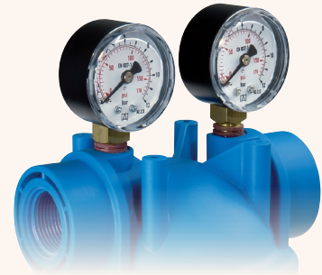
NPT Pressure Gauge