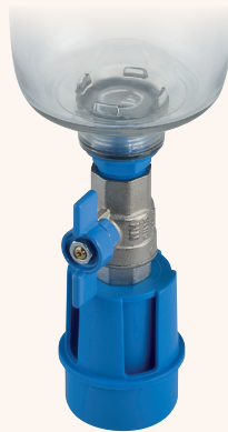
Bottom Drain Kit